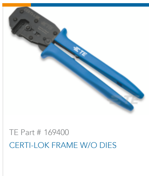
TE Part # 169400 CERTI-LOK FRAME W/O DIES