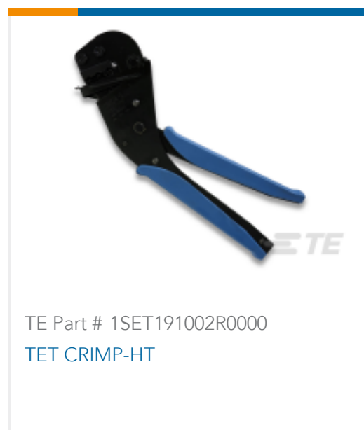
TE Part # 1SET191002R0000 TET CRIMP-HT