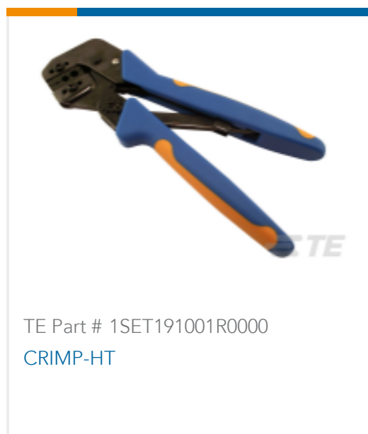
TE Part # 1SET191001R0000 CRIMP-HT