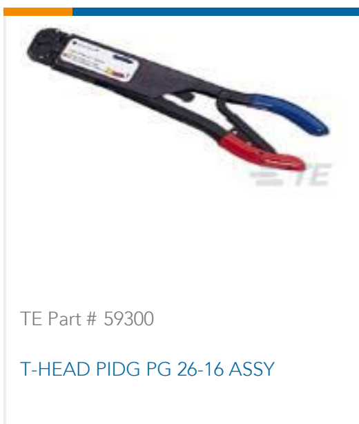
TE Part # 59300 T-HEAD PIDG PG 26-16 ASSY