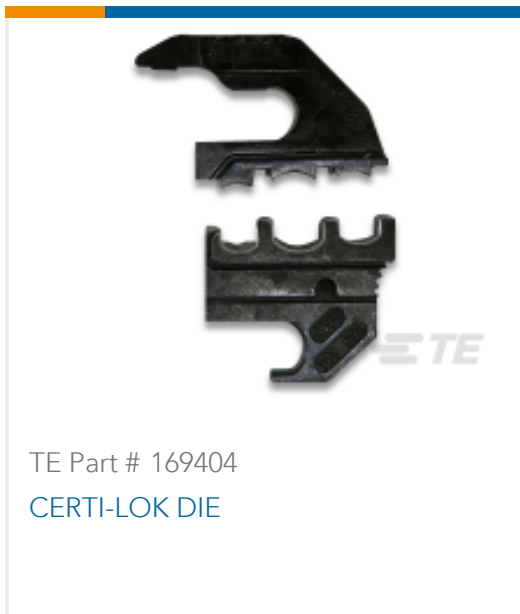
TE Part # 169404 CERTI-LOK DIE